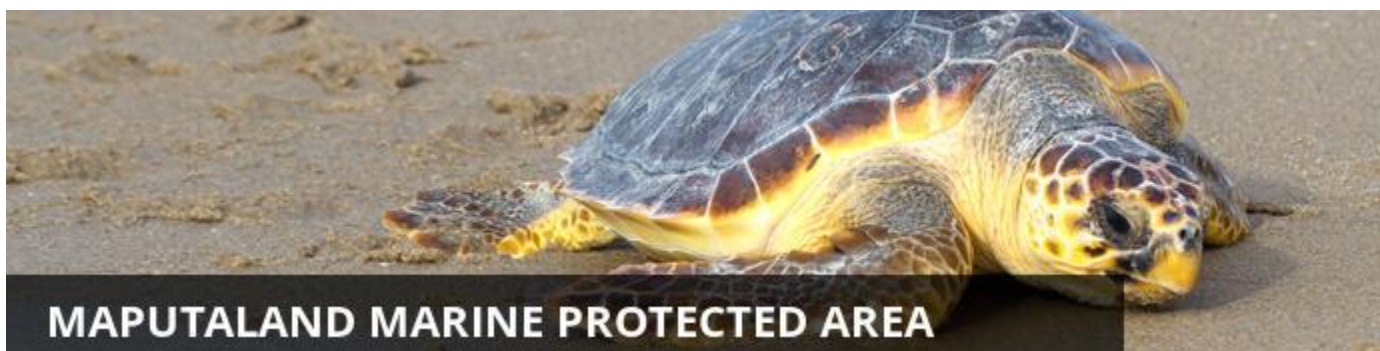
MAPUTALAND MARINE PROTECTED AREA

Located on South Africa's northeastern coast, the Maputaland Marine Protected Area falls within the iSimangaliso Wetland Park and comprises three protected areas, Lake Sibaya Nature Reserve, Kosi Bay Nature Reserve and Rocktail Bay. The reserve extends all the way from the northern Mozambican border to Sodwana Bay in the south. This gorgeous sub-tropical paradise includes immaculate forests and wetlands dotted with lakes and marshes as well as coral reefs and deserted golden-sand beaches and forest-clad coastal dunes. The local wildlife includes numerous bird species, reptiles and freshwater fish, making this an ideal destination for nature-loving travellers. Don't miss the opportunity to enjoy excellent diving opportunities at one of the world's top dive sites at Sodwana Bay with its magnificent reef complex.